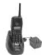
PARTNER wireless phone