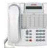
PARTNER 34-button display phone