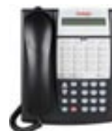
PARTNER 18-button display phone