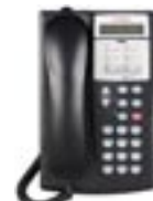
PARTNER 6-button display phone

Transfer a call...set up a conference call...create a list of frequently dialed numbers—PARTNER telephones make it easy. It's also simple to connect standard devices—no extra lines or adapters needed.